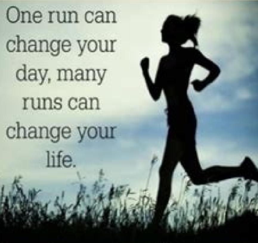
Do you love running? This is a useful running material for you: RunningSecrets365.blogspot.com

It's important here to focus on the word "implemented." There's nothing wrong with having a thousand great ideas, but if the only place they live is on your notepad what's the point? Better still, you need a good ending. If your previous company took your advice and ended up going bankrupt, that's not such a great example either. Be prepared with a story about an idea of yours that was taken from idea to implementation, and considered successful.