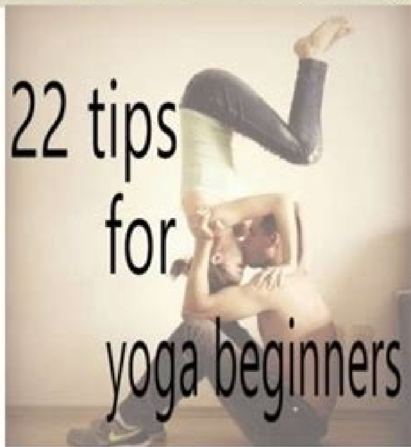
Here are link for this material: 22YogaTips.blogspot.com